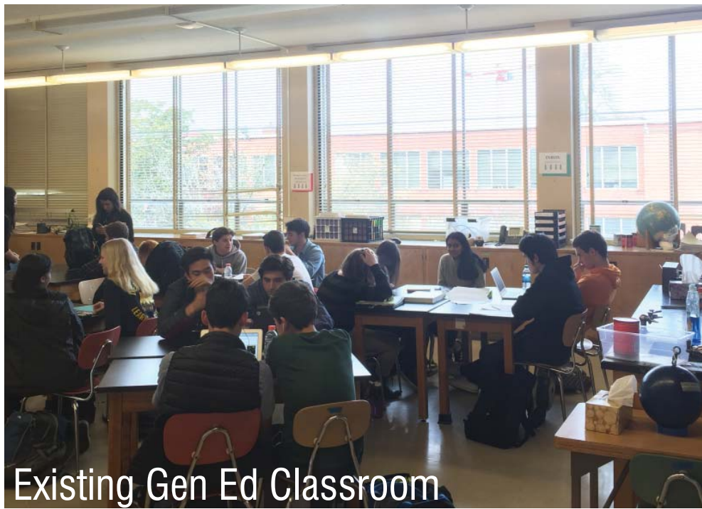
Existing Gen Ed Classroom