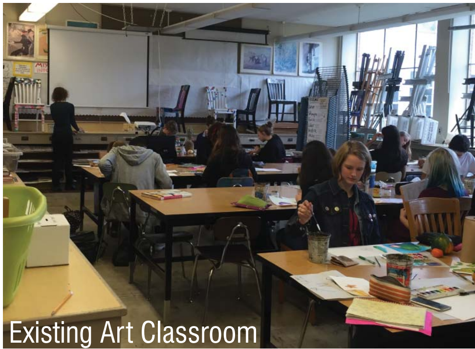
Existing Art Classroom