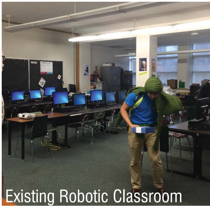
Existing Robotic Classroom