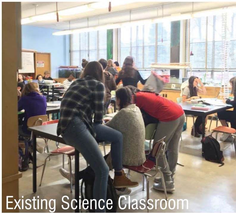
Existing Science Classroom